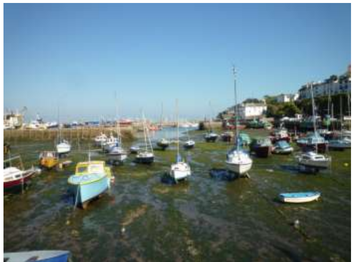
Visit to Dartmouth & Torbay in September 2011 (Devon, UK)

Initiated in 2010, the cooperation project has developed the bases of a network between the four partner nations initially involved. At this conference, the work done over the three years will be presented and a first review of MAIA will be done to define directions for the future. An exhibition on the theme of networking and connections between protected sites