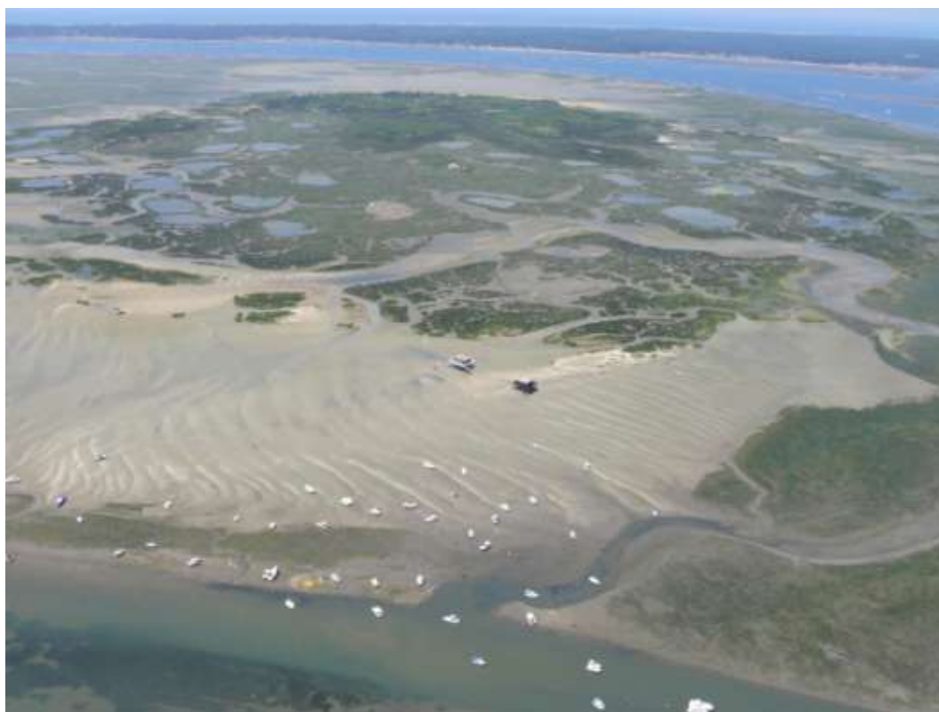
Ile aux Oiseaux, Bassin d'Arcachon, France